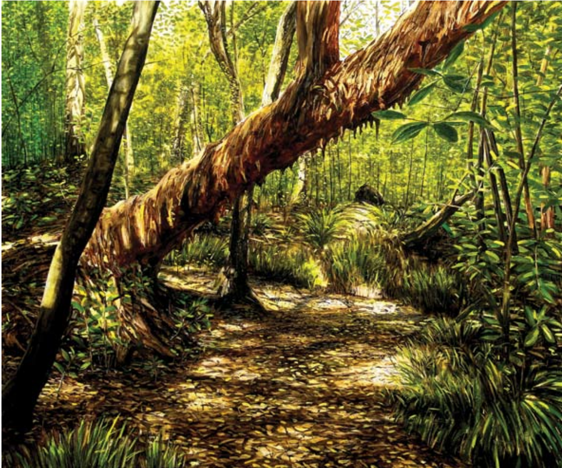
No.5, Oil on canvas, 150 x 125cm

A lonely car parked beneath a lamp on a road traversing urban bushland is inescapably sinister if you don't know whose car it is. There really might be a predator around. A path petering out in the daylight is different. There might be something buried there but probably it's only rubbish. The images in Sanctum Viridis do inspire unease despite their relatively benign settings. But then the disquiet settles into acceptance, again traversing real experience.