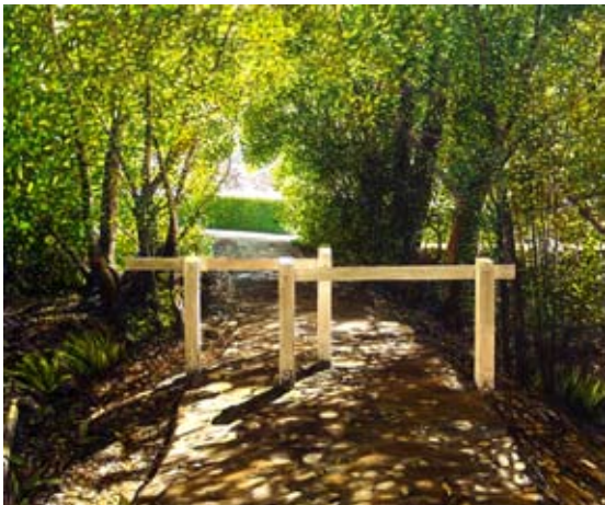
No.9, Oil on canvas, 150 x 125cm