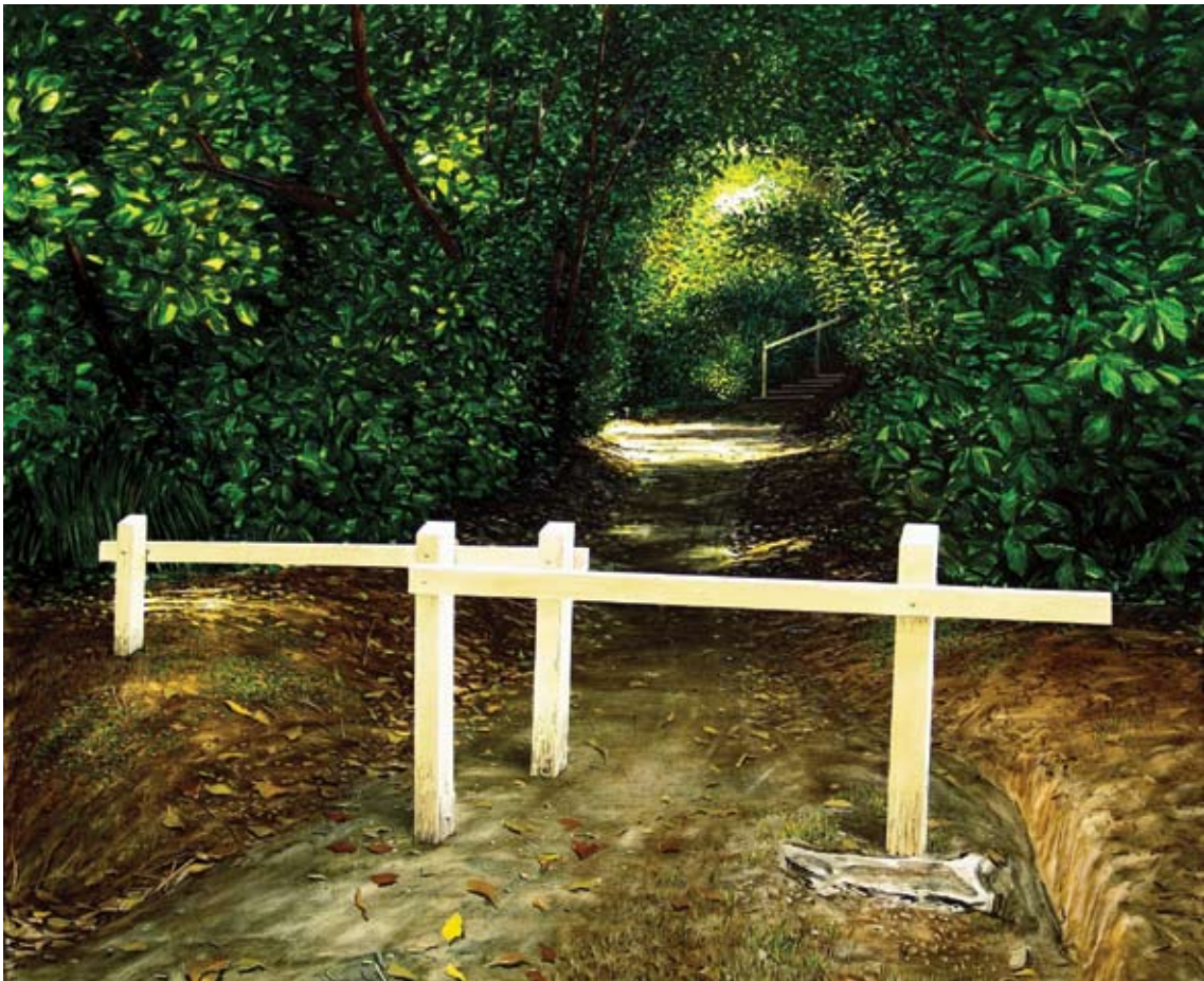
No.1, Oil on canvas, 150 x 125cm

Another Sam, Sam Neill, referring to New Zealand's film tradition, spoke about the 'cinema of unease' putting his finger on a recurring theme. Somehow New Zealand life with its apparent openness and simplicity, its unlayered landscapes with single buildings of recent history surrounded only by industrial detritus - a rusting tractor, a corrugated iron water tank, nothing suggesting any complexity of time or tradition - makes a compelling stage set for anxiety. It is as if this very simplicity, in fact the banality of what is placed before our eyes, moves the mind to contemplate possibilities of horror.