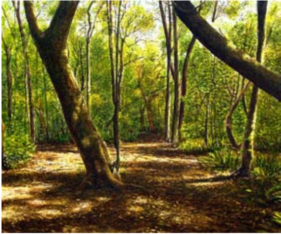
No.4, Oil on canvas, 150 x 125cm