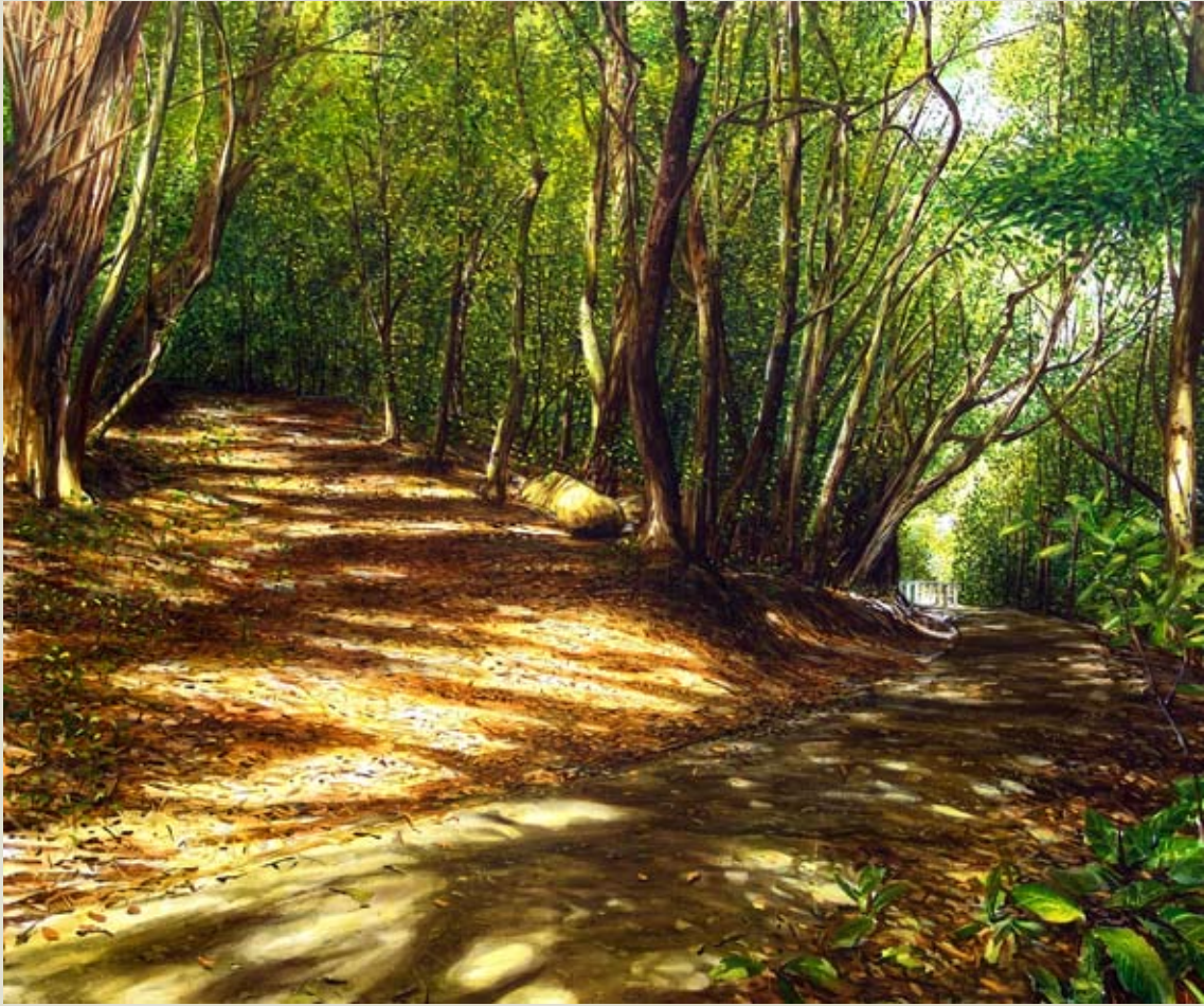
No.3, Oil on canvas, 150 x 125cm