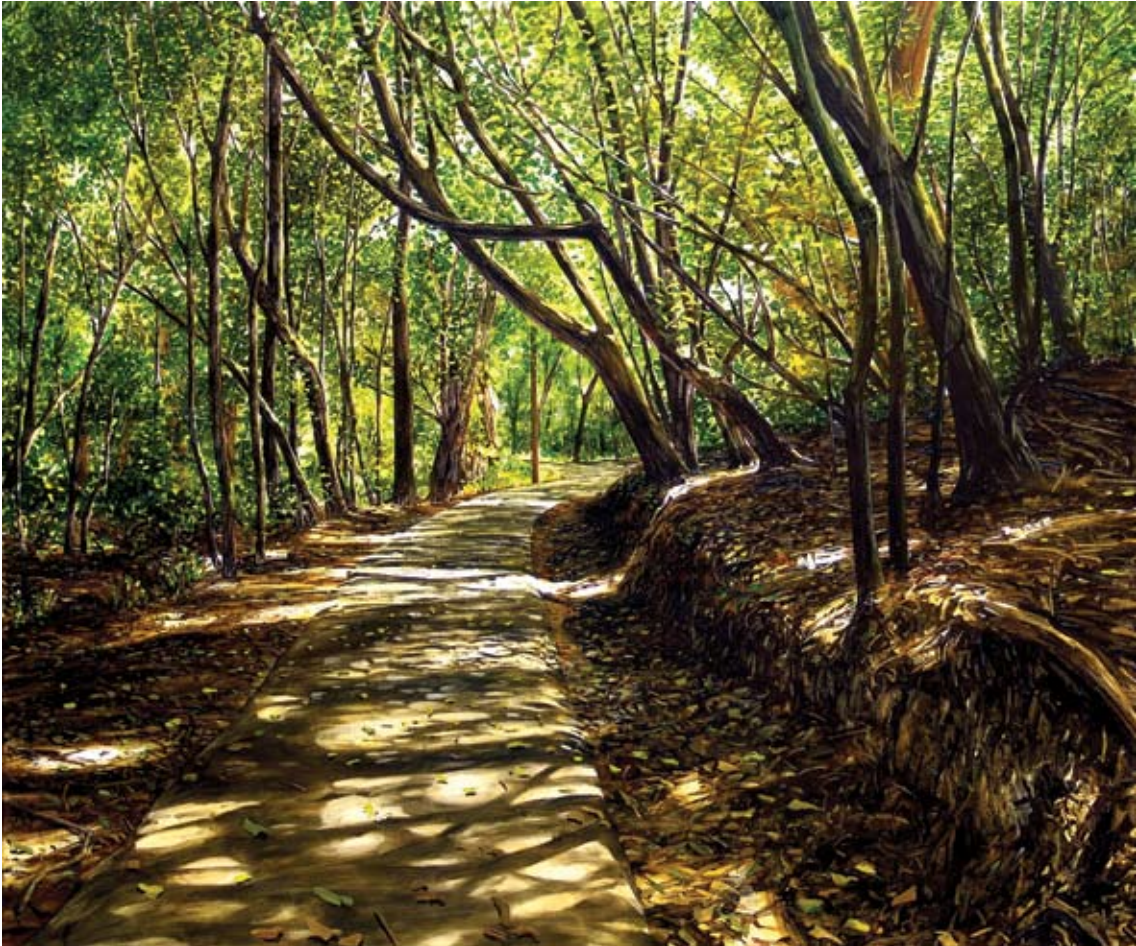
No.2, Oil on canvas, 150 x 125cm