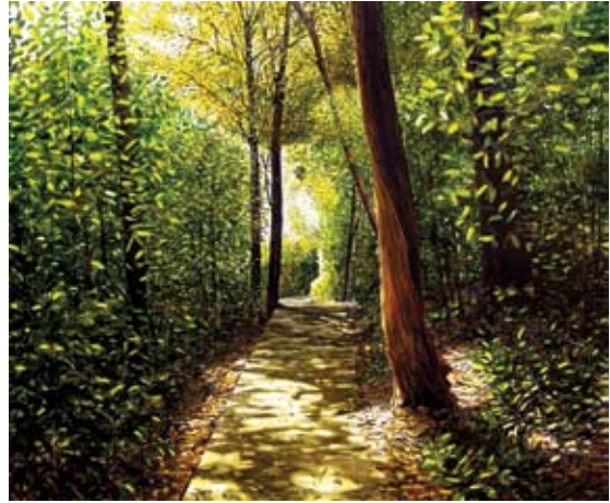
No.8, Oil on canvas, 150 x 125cm