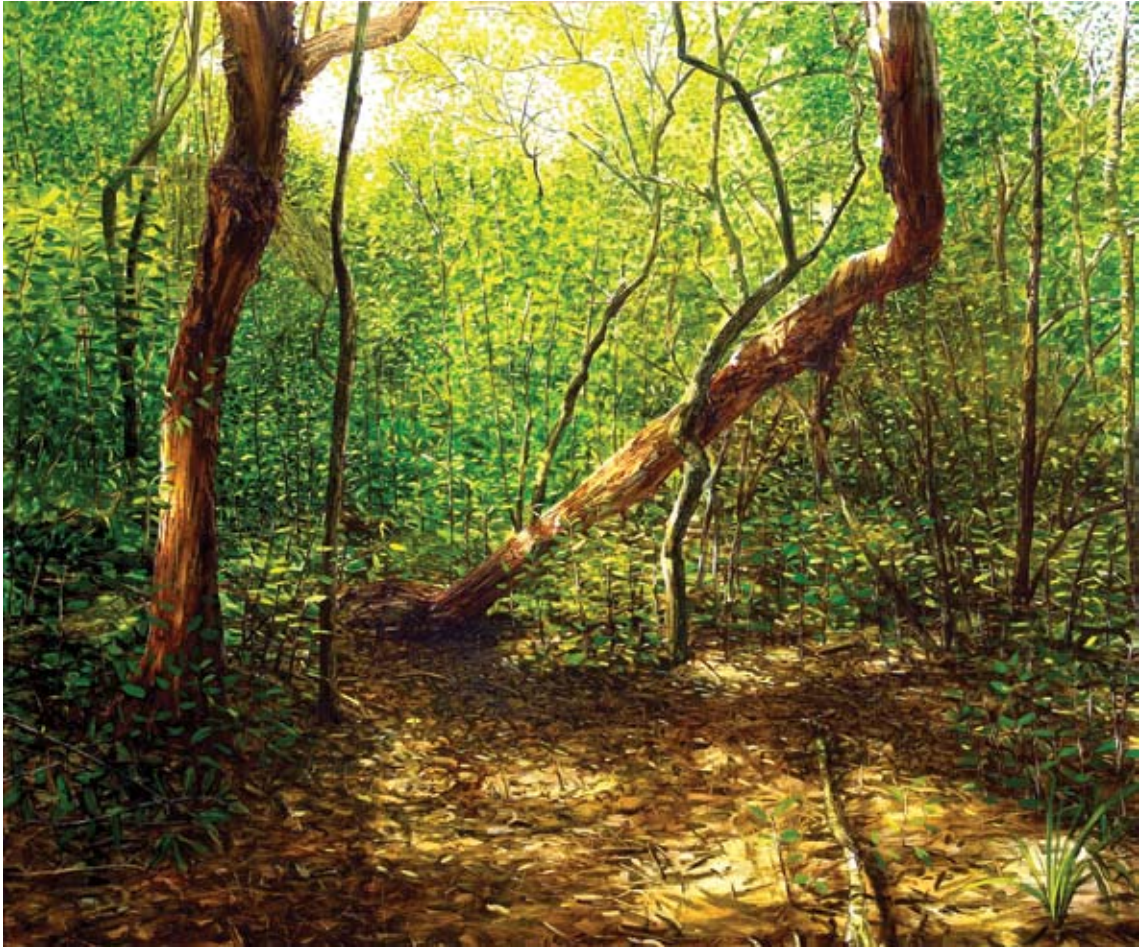
No.6, Oil on canvas, 150 x 125cm