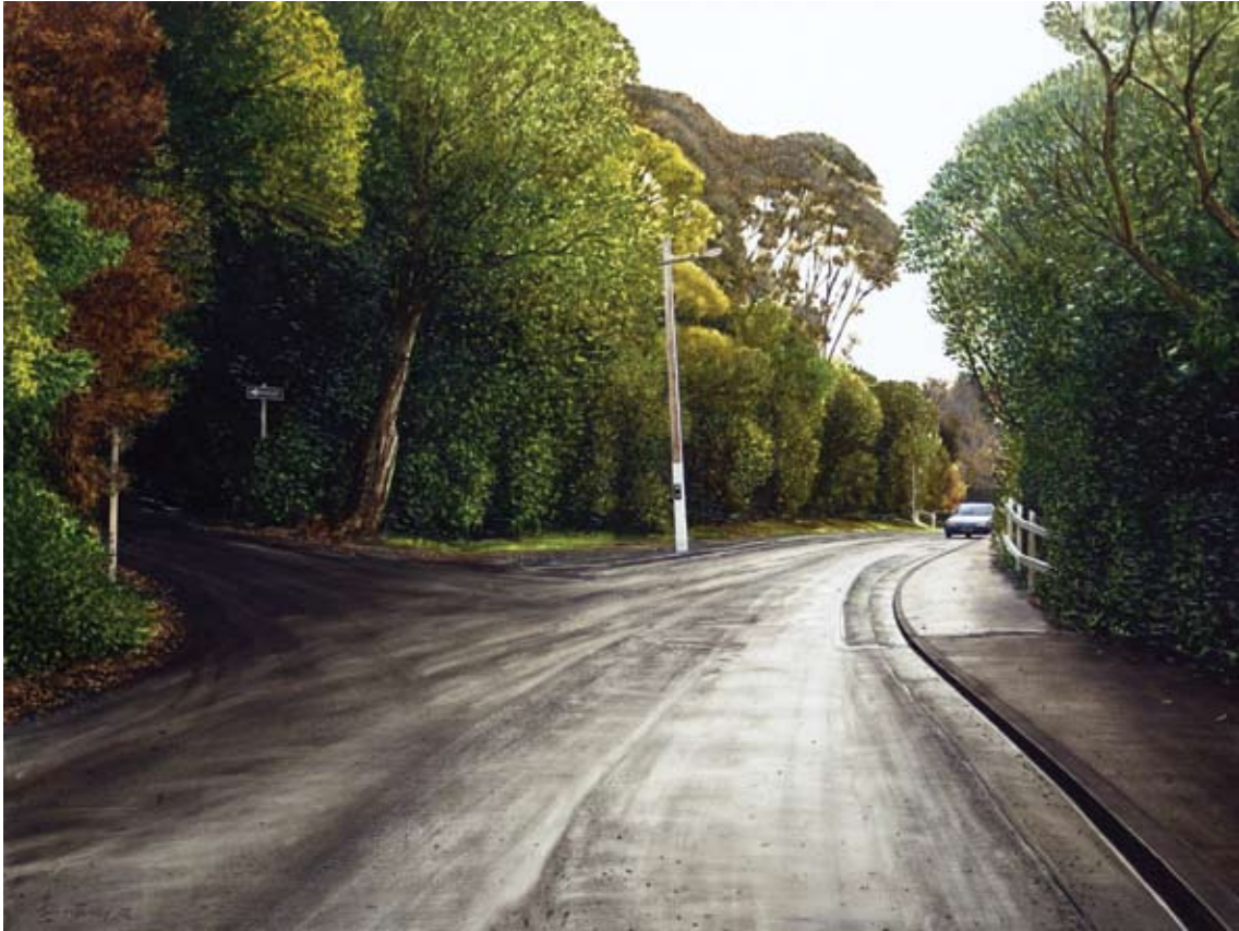
The One Way off Newington Avenue, Oil on canvas, 126x95cm