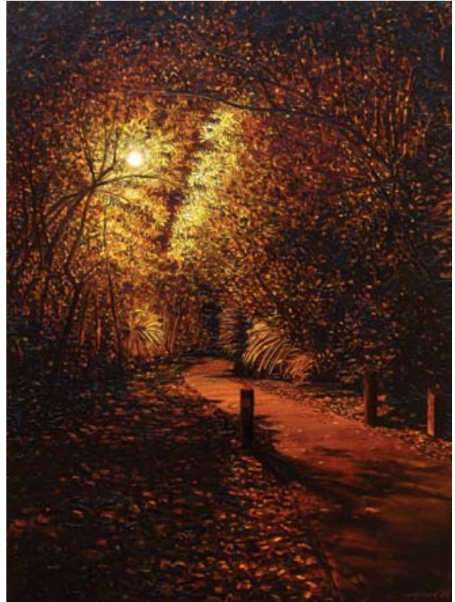
Top of the Path off Maori Road , Oil on canvas, 77x105cm

It is hard to avoid extrapolating on the significance of illumination in Foley's paintings. Benighted clearings, tar-seal lit by a suspended bulb and limned by the forest, look like philosophical assertions made by the painter about the deeply contextual, existential geographies we