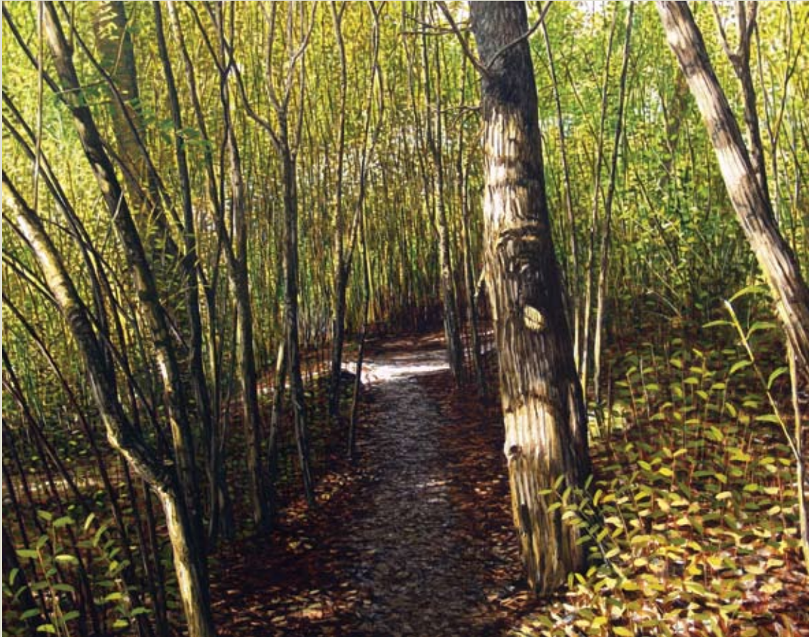
Walking Track, Jubilee Park, Oil on canvas 145x112cm