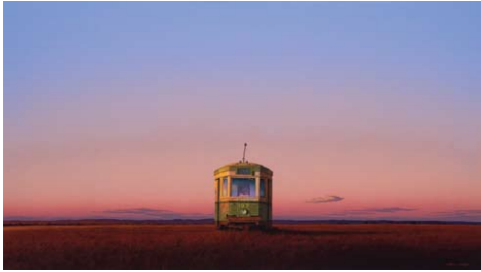
Steve Harris, Tram , acrylic on canvas, 65 x 116cm