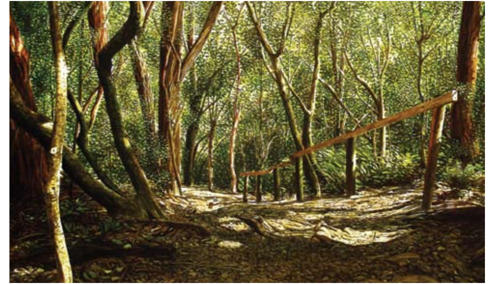
Sam Foley, Stairs Ross Creek Reserve , oil on canvas, 118 x 200cm