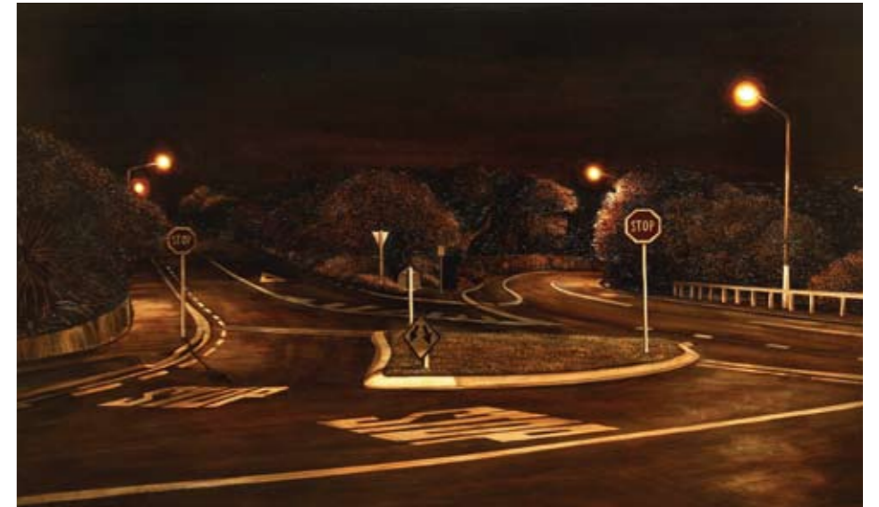
Sam Foley, Ohopo Intersection , oil on canvas, 118 x 200cm