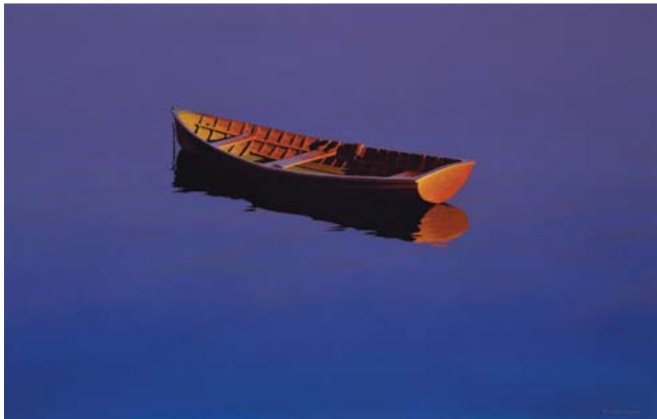
Steve Harris, Dingy in low light , acrylic on canvas, 75 x 116cm