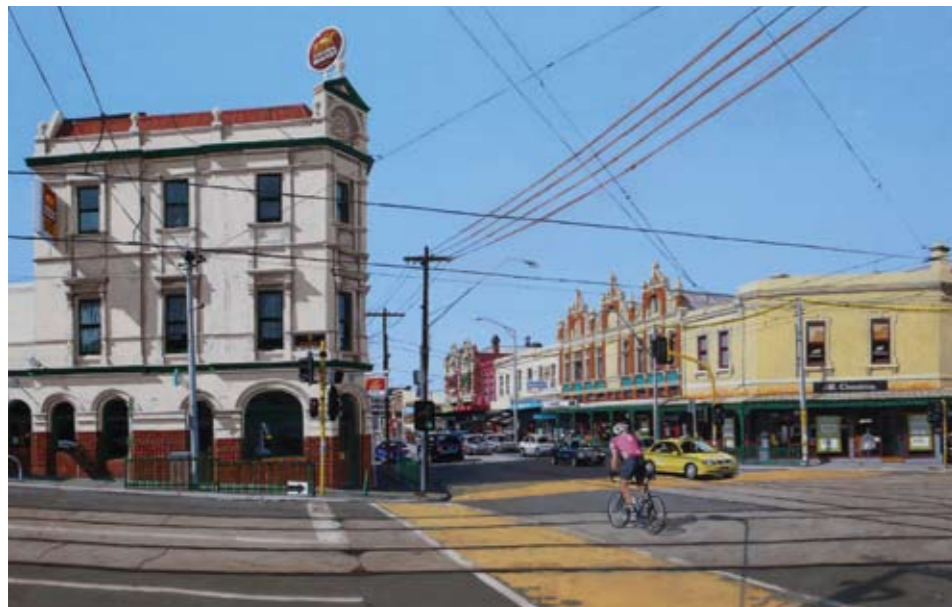
George Baloghy, Swan Hotel , oil on canvas, 66 x 101cm