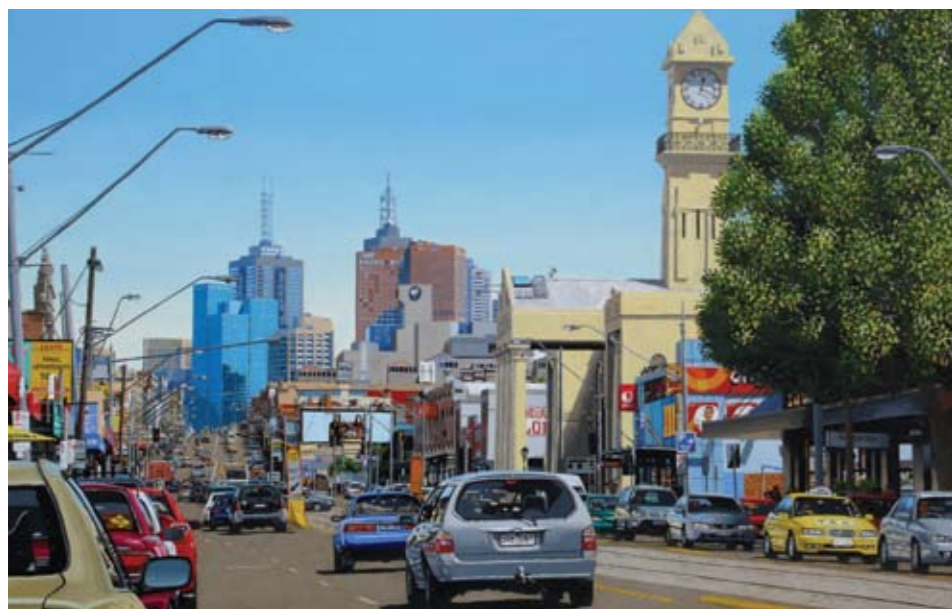
George Baloghy, Richmond Town Hall , oil on canvas, 66 x 101cm