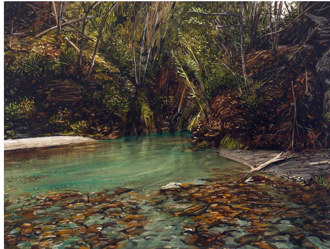
Dart Valley , oil on canvas, 100 x 76cm