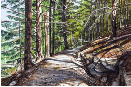
▲ Queenstown Hill Track acrylic on canvas, 34.5 x 23cm