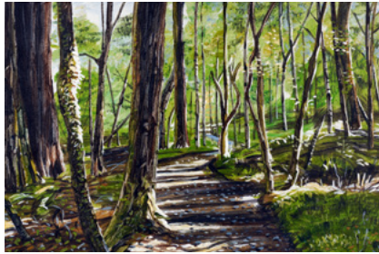
▲ Routeburn Track Study I acrylic on canvas, 34.5 x 23cm