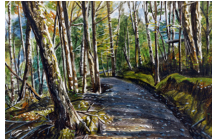
▲ Routeburn Track Study II acrylic on canvas, 34.5 x 23cm