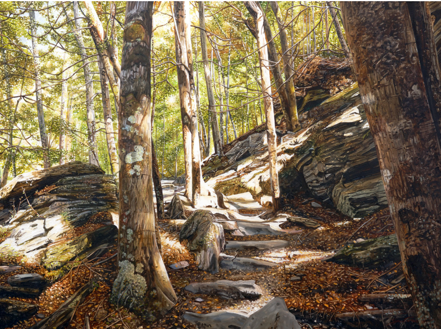
▲ Tiki Trail , oil on canvas, 150 x 110cm