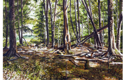
▲ Red Beech Forest Paradise , acrylic on canvas, 34.5 x 23cm