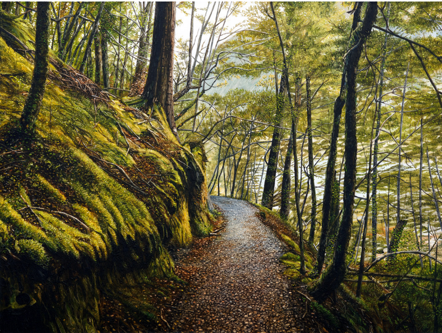
▲ Routeburn Track I , oil on canvas, 135 x 100cm