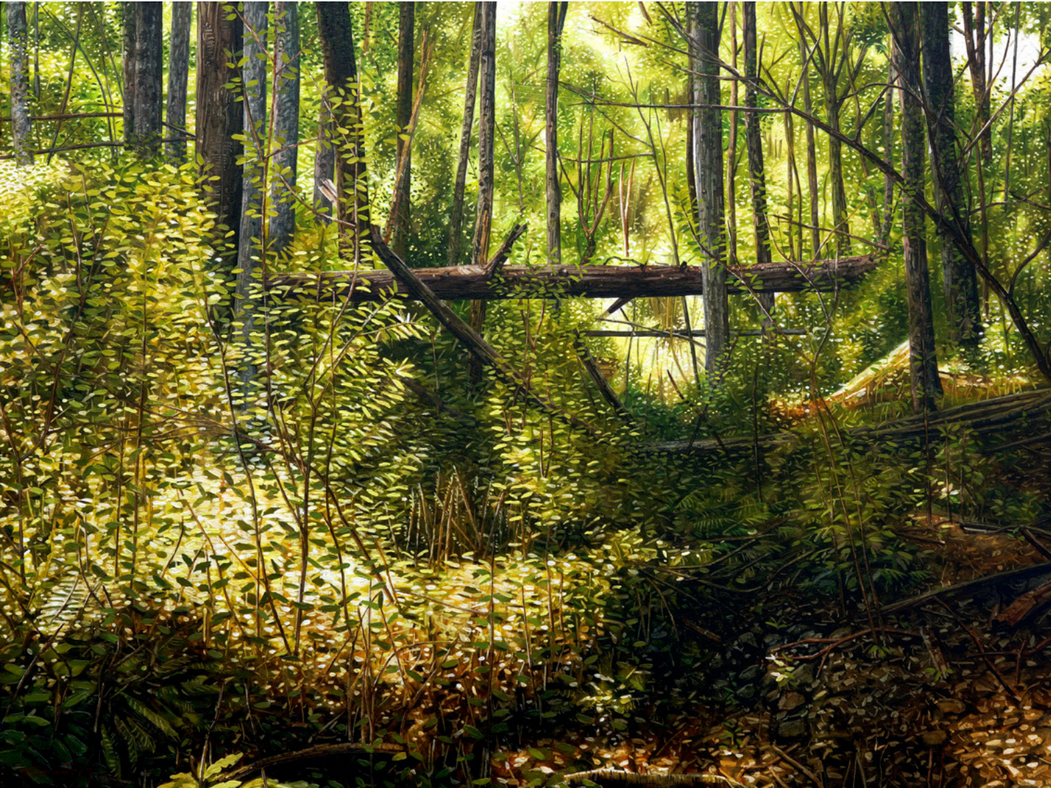
▲ Bob's Cove Forest (Return Of The Jedi) , oil on canvas, 135 x 100cm