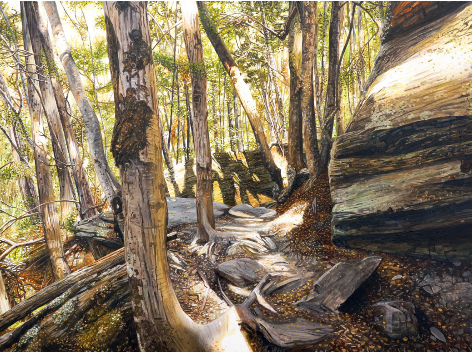
▲ Tiki Trail II , oil on canvas, 150 x 110cm