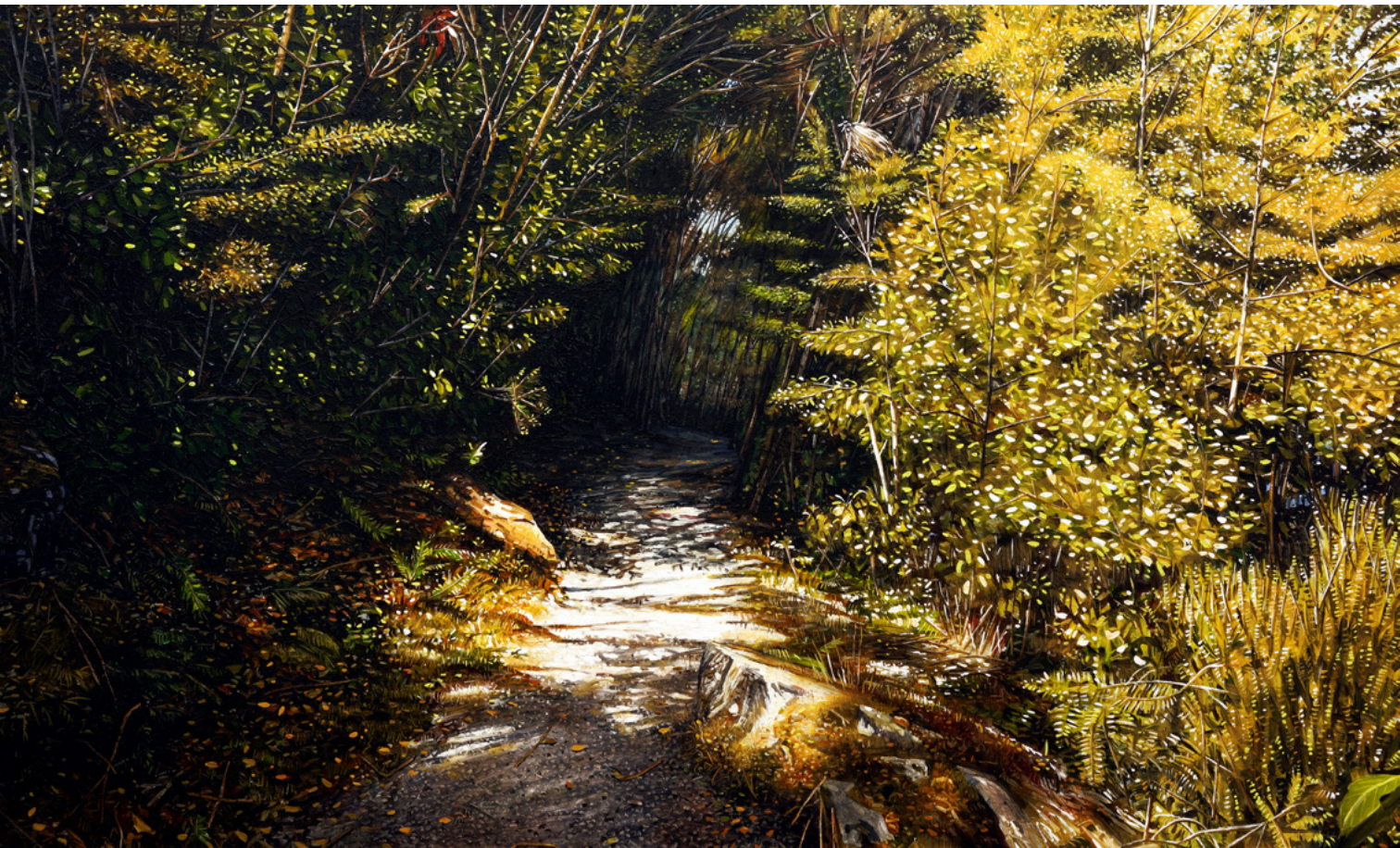
▲ Main Track, Bob's Cove , oil on canvas, 170 x 100cm