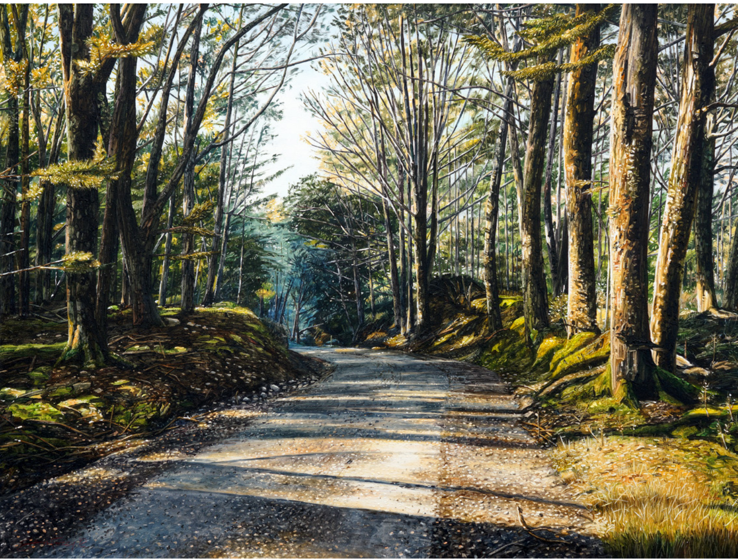
▲ Lake Sylvan Road , oil on canvas, 135 x 100cm