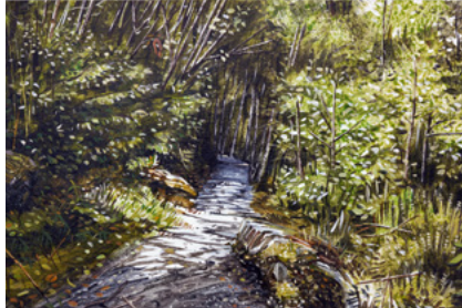
▲ Bob's Cove Loop Track Study acrylic on canvas, 34.5 x 23cm