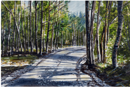
▲ Lake Sylvan Road Study acrylic on canvas, 34.5 x 23cm