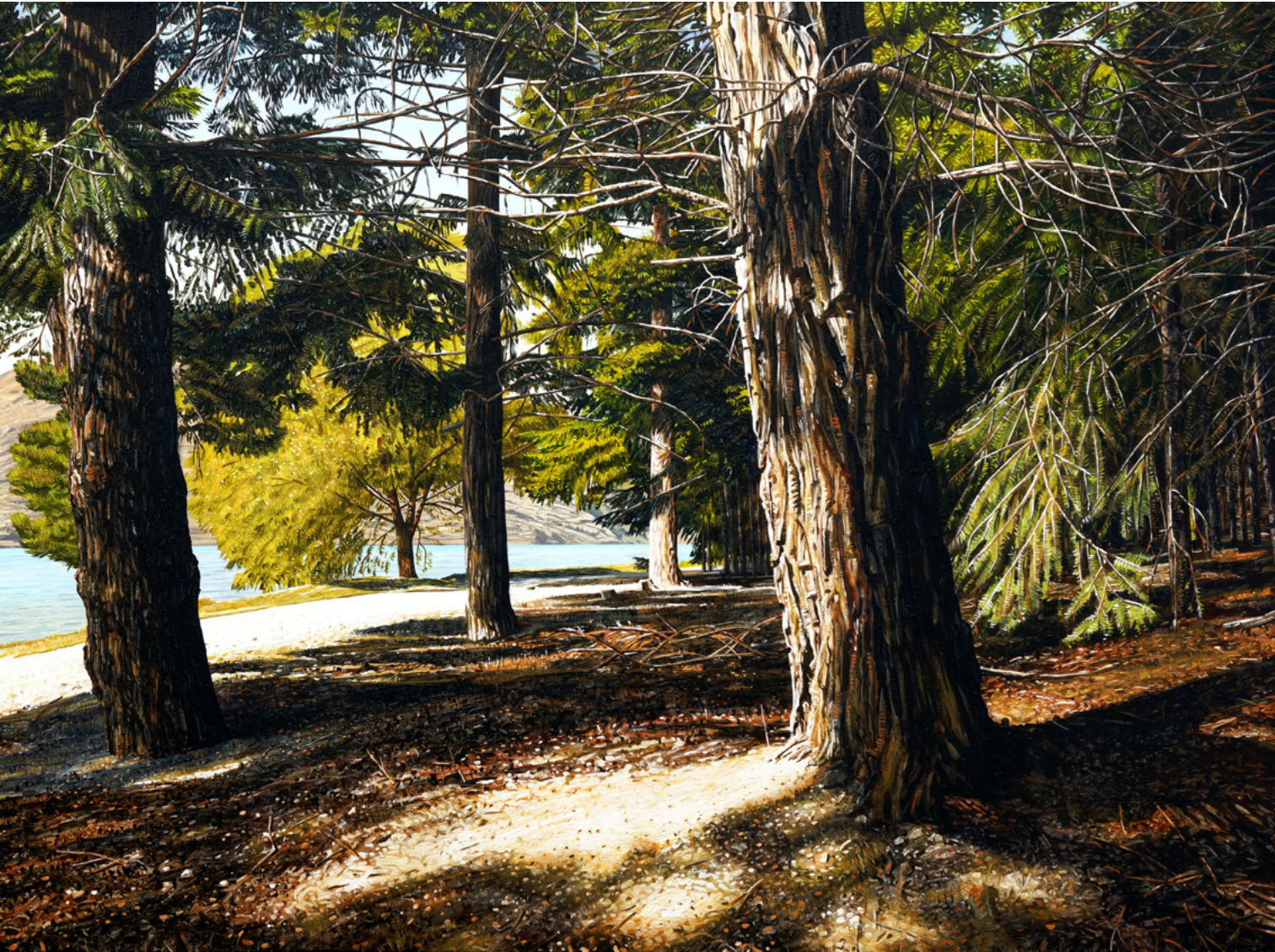
▲ Queenstown Trail, Queenstown Gardens , oil on canvas, 150 x 110cm