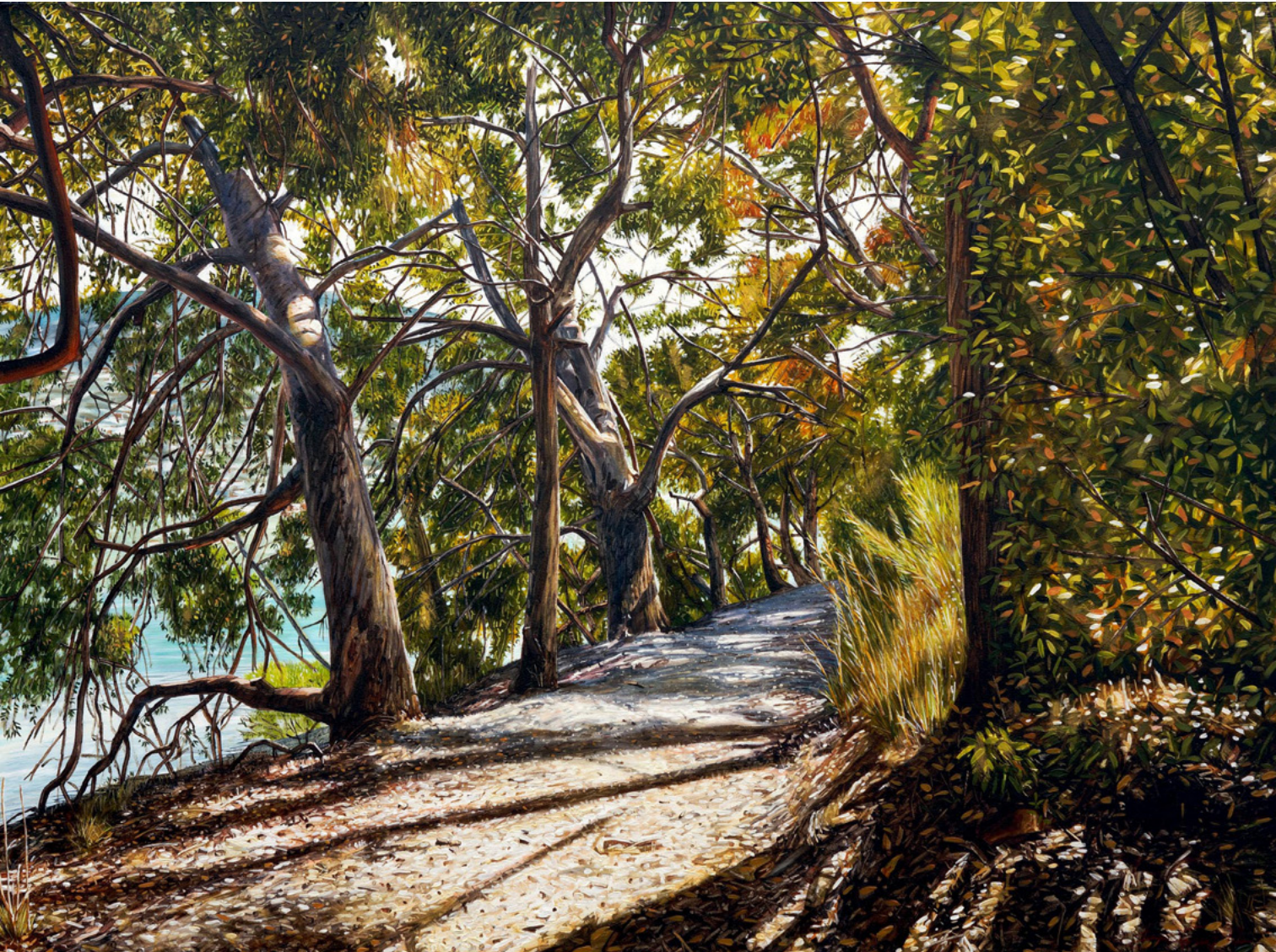
▲ Queenstown Trail, Kelvin Heights , oil on canvas, 135 x 100cm