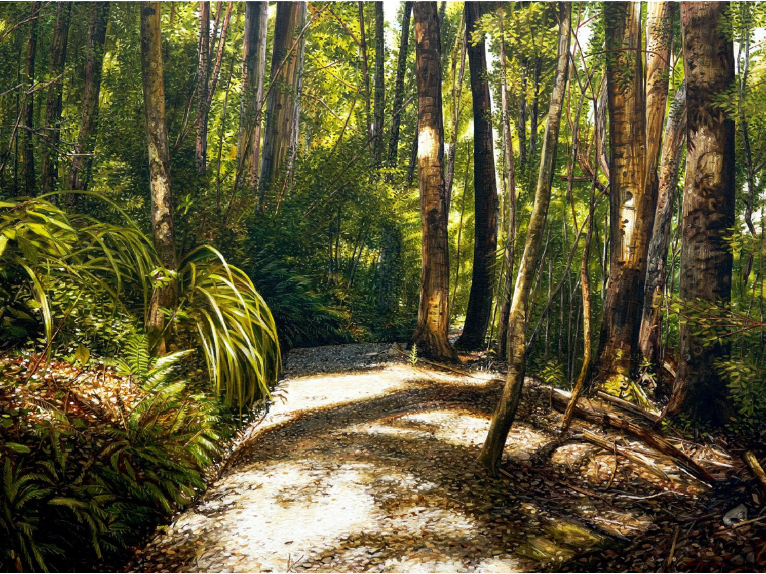
▲ Bob's Cove Loop Track , oil on canvas, 135 x 100cm