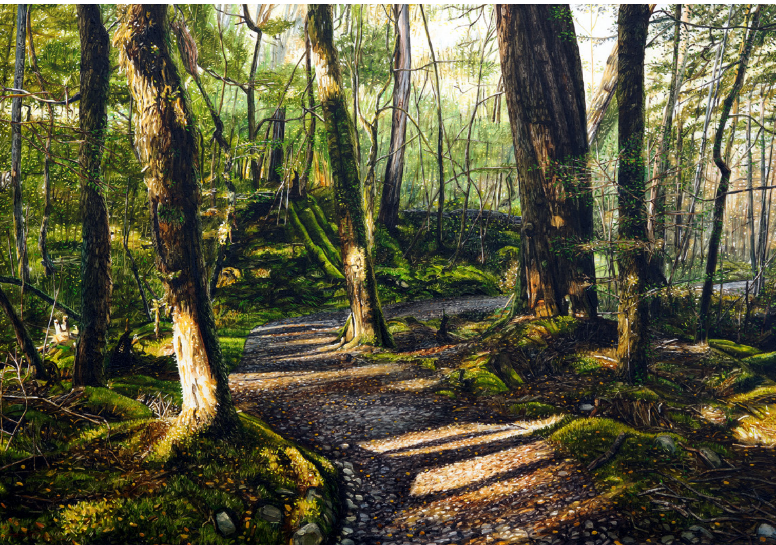
▲ Routeburn Track II , oil on canvas, 160 x 110cm